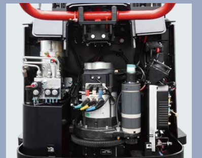
Back cover can be opened fully