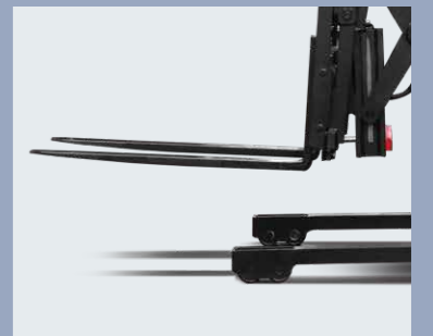
Proportional controlled forks can be operated more accurately